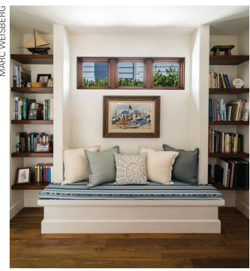
A little reading nook makes a perfect place to spend with grandkids.

A: Yes, it seems clients are embracing this new part of their life. My Newport Beach/Port Street clients remodeled their master suite after living in the home for 30 years. They had remodeled and