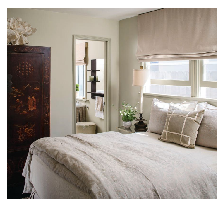
Beachy bungalow is perfect for a romantic getaway.

A: I have another client in Lido Island who simply moved into a larger home just down the street from where they used to live to accommodate the kids and grandkids. Another client sold their home and bought a smaller home in Turtle Rock where they live fulltime and are leasing a bungalow in