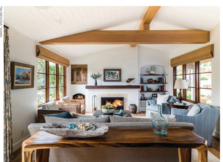
Remodeling a home instead of downsizing to a smaller one is the order of the day for

Corona del Mar to have more space. It is two bedrooms, one bath and perfect for a guesthouse when their family wants to come and stay. They updated the finishes with a little remodel to the kitchen and were able to use the furniture from the larger home they sold in both the Turtle Rock and Corona del Mar